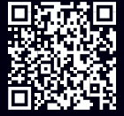
RUTM51 360° VIEW

The RUTM51 is a budget-friendly dual-SIM, multi-network industrial 5G router delivering connectivity for data-heavy applications. With five Gigabit Ethernet ports, dual-band Wi-Fi, and auto-failover, it ensures seamless, reliable performance. Backward compatibility with 4G Cat 12 and a versatile range of interfaces make the RUTM51 5G router a smart, future-proof choice for businesses seeking high-speed connectivity at a lower cost.