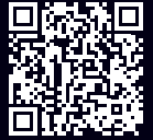
ATRM50 360° VIEW

The ATRM50 is a rugged 5G router built for transportation, featuring 4 x M12 Gigabit Ethernet ports and M12 power input for durable, secure connections. It delivers ultra-high cellular speeds up to 3.4 Gbps and supports dual SIM with eSIM™ for seamless failover. Certified to EN 45545-2 and EN 50155 standards, the ATRM50 is engineered to meet the rigorous safety and reliability requirements of railway systems—while also being a strong fit for other demanding transportation environments. The router comes with GNSS, an integrated mounting bracket, and is compatible with RMS for efficient on-site and remote management.